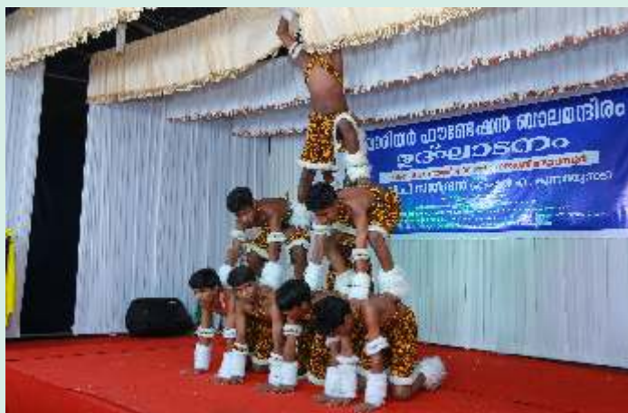
Balmandiram in-house dance programme on Inauguration Day