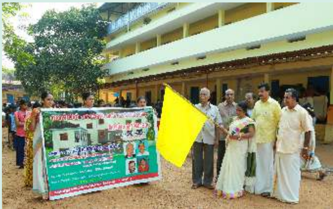
Inaugural procession of Balmandiram, Ernakulam

There was a divine Grace and with the utmost commitment of local committee a small plot of Land was identified, which with the help of committee members and local people was subsequently extended to more than one acre. The foundation stone of the building was laid on June 2016 when there was heavy rain. There was lot of hassles like bad weather, delay in concurrence in buying the land from different owners, lack of approach road etc. But due to amazing commitment and dedication of the Contractor and local team the building was completed within 6 months. The total area of Balmandir is now 15,000 sqft with 2 halls for conducting any program, events or camps. We even widened canal roads, putting a small concrete block at canal and even allowing to break the front wall of neighbour's building also. It was all a great success. Part of the land purchased was paddy field which we were able to convert into non agricultural land with the help of govt authorities. All these activities were happening due to Divine Grace