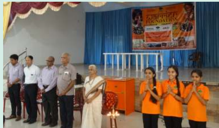
Prayer by Balamandiram students

to education and professional skills. One of their CSR consultants, Sattva, selected Warrier Foundation as one of the NGOs for imparting English and Computer Literacy as a part of HITACHI CSR ACTIVITY as their pilot project.