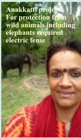
Anakkatti project - For protection from wild animals including elephants required electric fence

Mother earth is protecting us unconditionally. It is high time for us to give back to the nature. With that intention, we have already acquired 15 acres of land, which is in the final stages of electric fencing since we have to protect it from animals, deer, elephants and wild buffalos. A centre is also under construction and we are trying to complete it by this year end. This will be a herculean task for identifying the trees and doing