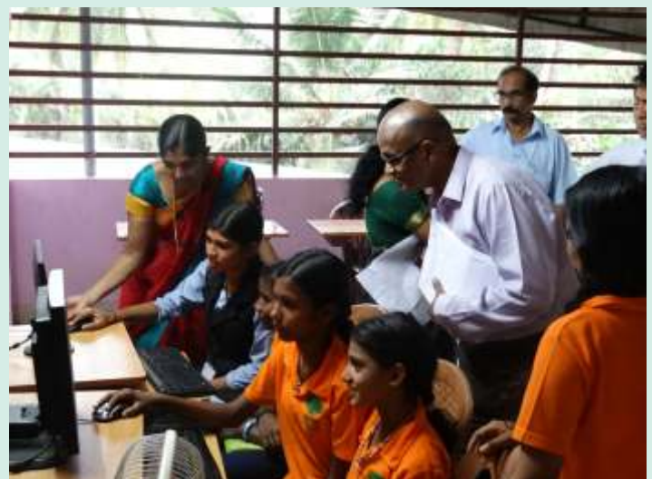
Computer Classes by IL&FS

We are indebted to Hitachi for their support of Warrier Foundation for carrying out this on-going educational project.