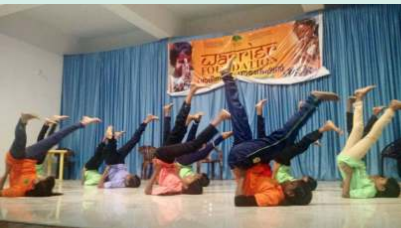
Yoga Dance by Balamandir students

There is an ecstasy, an absolute freedom and unconditional love while being associated with Warrier Foundation which will lead to "Universal Family-vasudaivakudumbakam".