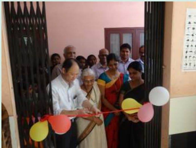
Inauguration of HITACHI CSR project at Balamandir, Thirunavaya, Kerala

During this year they have taken lot of projects relating