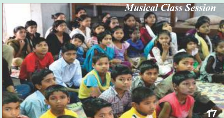
Musical Class Session

Thus my personal journey through dance continues through perfecting the art form further through my studies, by pursuing my MFA from Chennai to creating more and more awareness about the inherent values of art throughout the society.