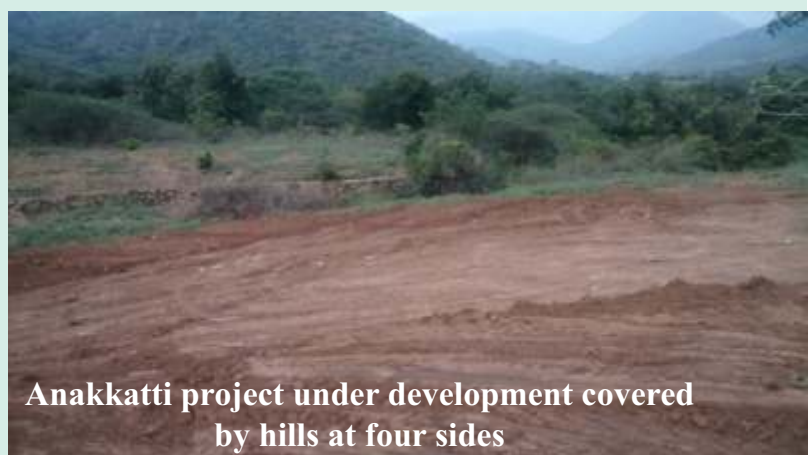
Anakkatti project under development covered by hills at four sides

plantation at a remote hilly area, where we also have to consider for water preservation and other eco-friendly projects. This will be a new experience for Warrier Foundation to get related to nature, mother earth and to protect it with total dedication and surrender. We are proud and confident that this project will be completed in time. There were lot of hassles and