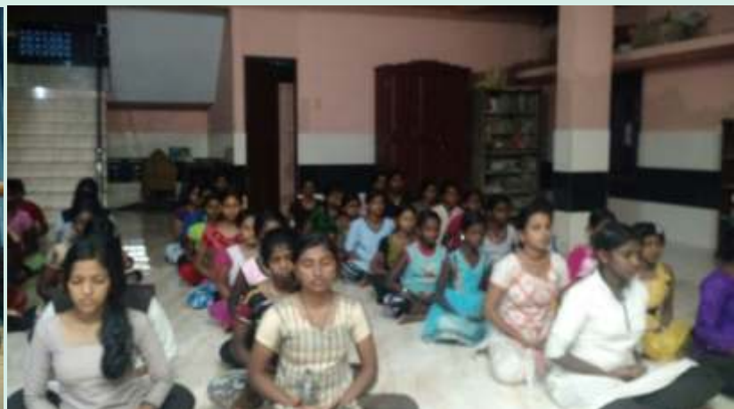
Meditation session by Balamandir students